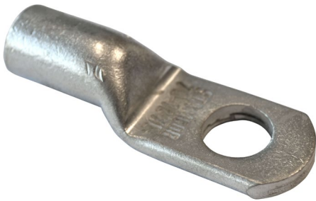
example of a standard lug